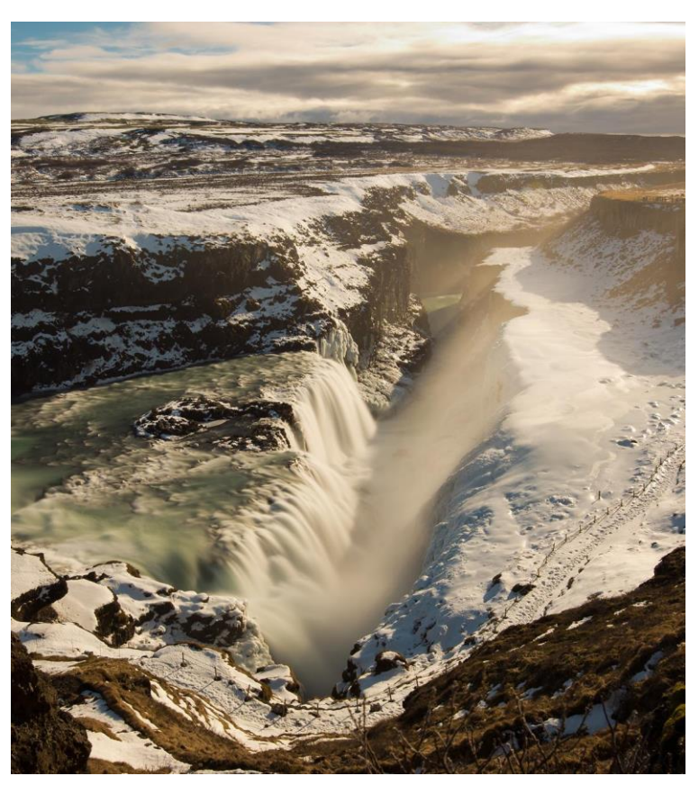
7 Days • 11 Meals: 6 Breakfasts, 5 Dinners

HIGHLIGHTS... Reykjavík, Northern Lights Cruise, Search for the Northern Lights, Golden Circle, Thingvellir National Park, Lava Exhibition Center, Vik, Jökulsárlón Glacial Lagoon, Blue Lagoon